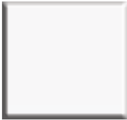
Petal White PCR01

Invincible™ finishes its steel laboratory furniture and fume hoods with a special powder coating process. The uniquely formulated epoxy urethane hybrid powder coat finish has excellent chemical and abrasion resistance. IMF Solutions LLC dba Invincible™ powder paint finishes are SEFA 8 compliant. We offer a choice of thirteen (13) standard powder coat colors at no difference in price.