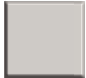
Dove Grey PCR08