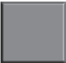
Slate Grey PCR09