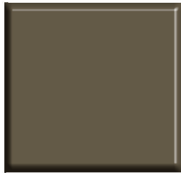
Dark Khaki PCR07