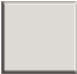
Shell White PCR02